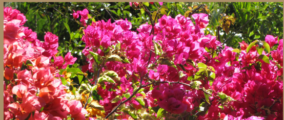
Bougainvillea (Bougainvillea sp.)